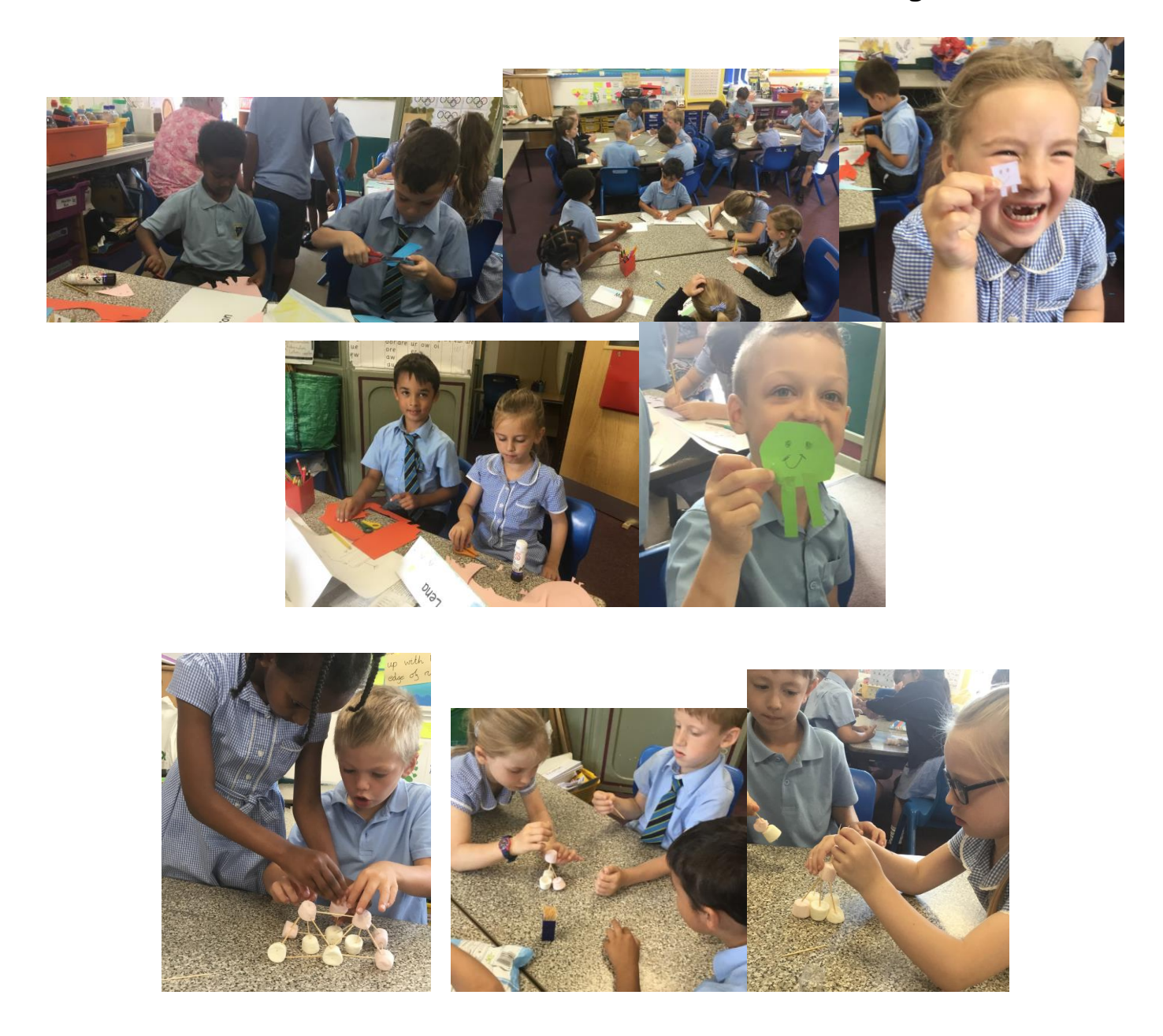
We can't wait to be back together in September!

This is what we did on our transition mornings.